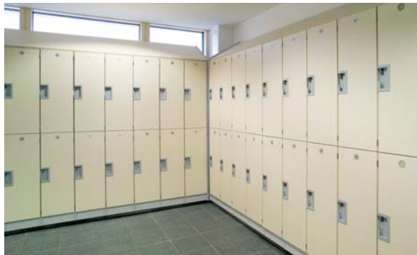
Student changing room lockers