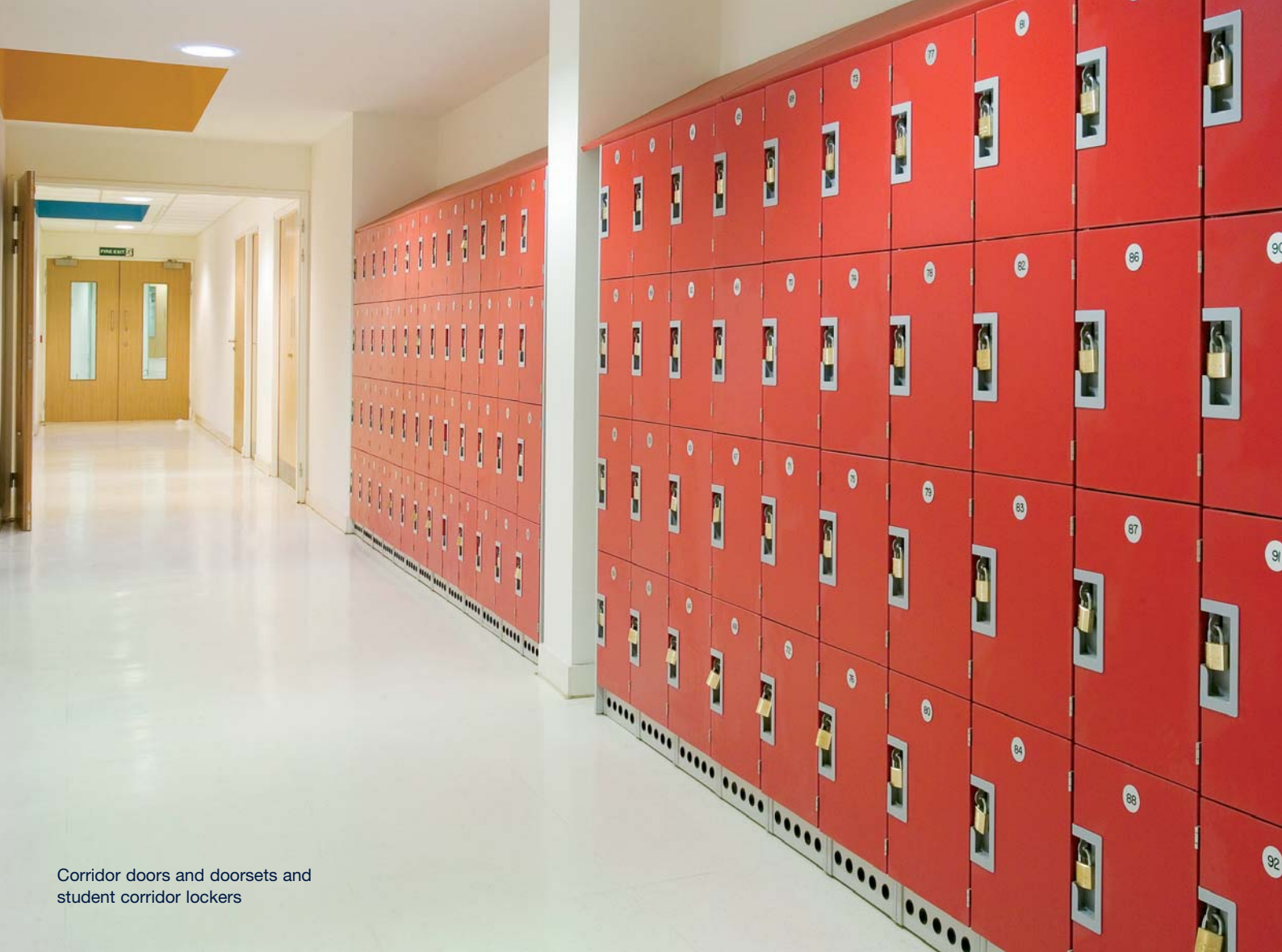
Corridor doors and doorsets and student corridor lockers