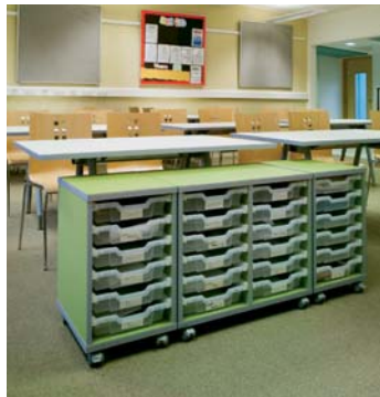
Student storage units