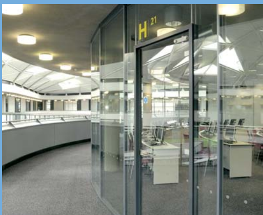
Half-hour glazed fire door in the PolarTec aluminium door frame

Left: Both faceted and straight PolarTec glazed partitioning are used to create stunning modern classroom environments and workspaces