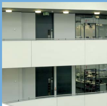
Half-hour fire rated timber door modules